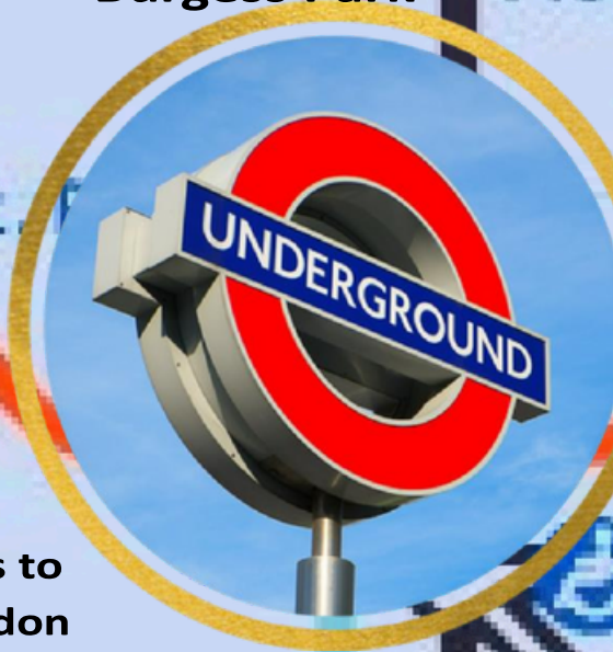
Easy access to Central London