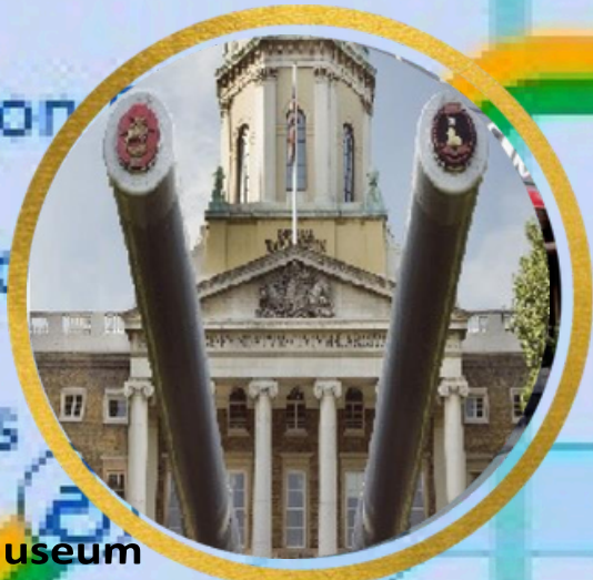
Imperial War Museum